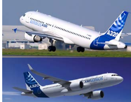
Above: Standard Airbus 320 Below: Airbus 320 NEO, which improvements include less fuel consumption, two tonnes of additional payload, up to 500 nautical miles of more range, lower operating costs, along with reductions in engine noise and emissions.

Currently, Garuda Citilink operates six B-737-300s and -737-400s to serve and connect eight